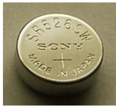
Silver Oxide Battery, SR626SW

Sony Corporation (Tokyo, Japan) today announced the accomplishment of the world's first* Mercury-free silver oxide battery, which was considered difficult within the industry. Starting January 2005, 10 models of mercury-free batteries will be commercialized on a world-wide basis. (* as of September 29 th , 2004)