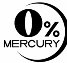
Sony's Mercury-Free Logo mark